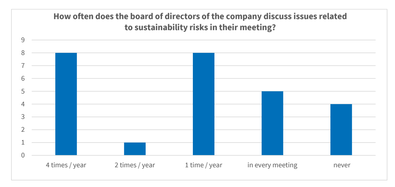
Chart 2. How often does the board of directors of the company discuss issues related to sustainability risks?